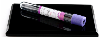
i-PRF+™ Blood Collection Vial