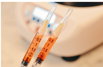
i-PRF+™ Ready for Injection