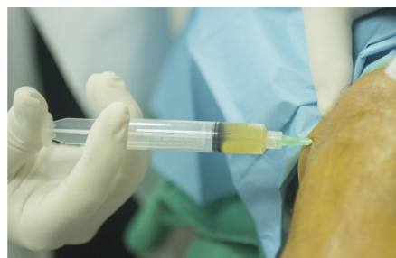
i-PRF+™ Knee Injection