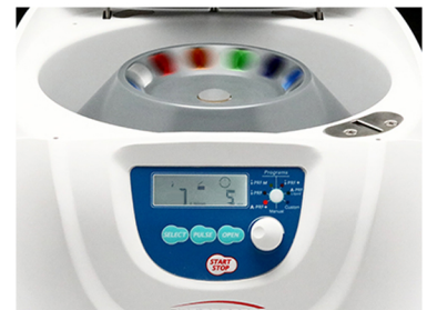
Protocol for i-PRF+™